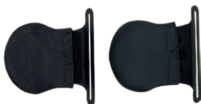
▲ E2 Deep Back E2 Deep - 15cm Contour