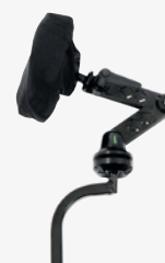
Invacare Matrix® Elan Headrest