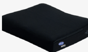
Invacare Matrix® Libra cushion