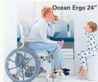
Ocean Ergo 24"