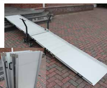
Movable ramp 4,8 m with Trolley