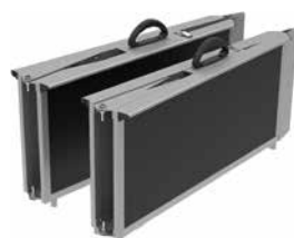
Foldable ramps, pair