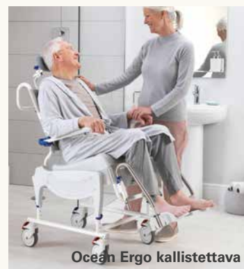
Ocean Ergo kallistettava

Rental pricing is based on a daily rent. In short-term rentals, the minimum billing period is one (1) month . Products can be returned also earlier. Rents are invoiced monthly at the last day of the month. We check credit information from private customers and require a personal identification number (ID). As an alternative, advance payment is accepted for foreign tourists.