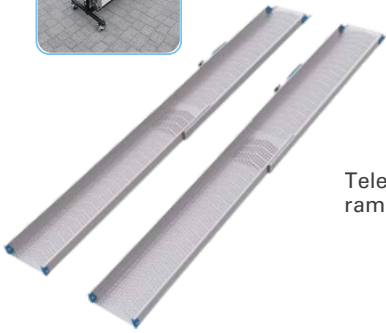
Telescopic ramp, pair