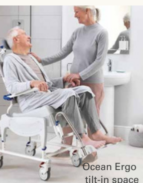
Ocean Ergo tilt-in space