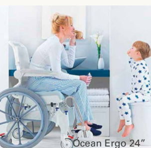
Ocean Ergo 24"

When you want to rent contact: info@campmobility.fi / phone +358 9 35076 310 (Mon–Fri 8–16)