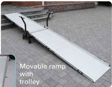
Movable ramp with trolley